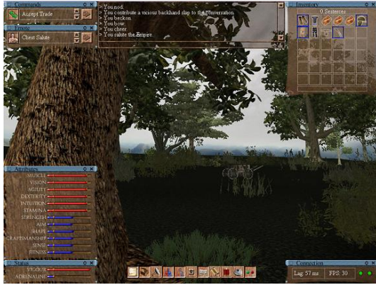
Figure 1. Original MMOG screenshot.