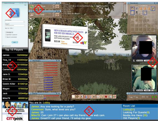
Figure 2. IGIT-modified MMOG screenshot.

advertisement; (5) MMOG specific chat to enable the users in a specific scene to cooperate; (6) In-game 3D UGC. In this example, a user added a note on a tree to publish an eBay auction; (7) two windows of a video chat with casual friends or cooperative players. The choices of which application to use and the applications' screen location are under the control of the user (player).