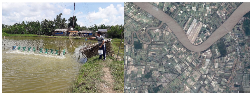
Fig. 1 Left: Shrimp farmer applying feed in a semi-intensive shrimp production system. Right: Google earth view of the My Thanh River mouth in Soc Trang province, Mekong Delta (Vietnam), in August 2015, illustrating the concentration of shrimp ponds in the landscape

(Struik et al. 2014). Similar to the agricultural sector, aquaculture production systems and value chains, especially for shrimp as an export commodity, are strongly influenced by food safety regulations and product quality, with the development of quality standards. Therefore, even if farms are central to the innovation process, an analysis of the constraints to innovation requires a framework that not only encompasses economic or technical dimensions, but also integrates biophysical, institutional, and market structure dimensions. Innovation is thus the outcome of a multi-stakeholder process of actors linked to those dimensions, involving different value chain actors and their broader regulatory and support environment, which then jointly form an aquaculture innovation system (Doloreux et al. 2009; Joffre et al. 2017).